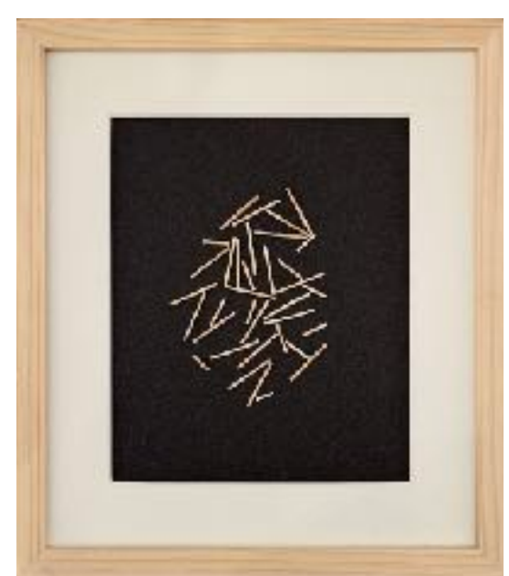
Jeronimo Villa, Blind 1,2,3 and 5, 2021, headless matches on sandpaper, 39.5 x 34.5 cm