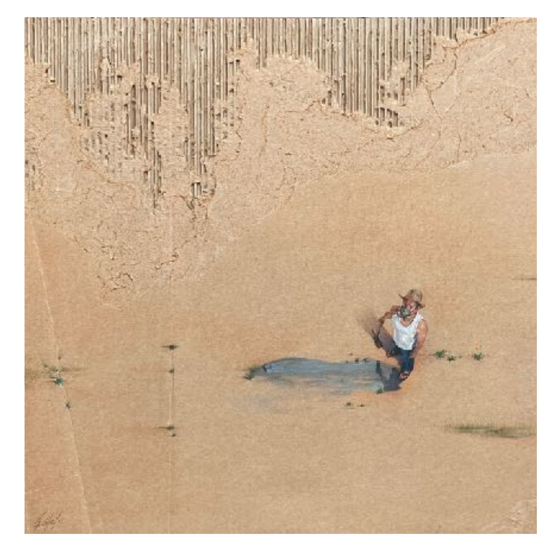
Armando Castro-Uribe, Bitter Sigh, 2022, mixed media on cardboard, 66 x 72 cm