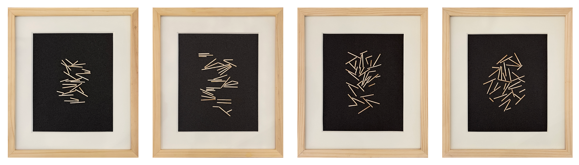
Jeronimo Villa, Blind 1,2,3 and 5, 2021, headless matches on sandpaper, 39.5 x 34.5 cm