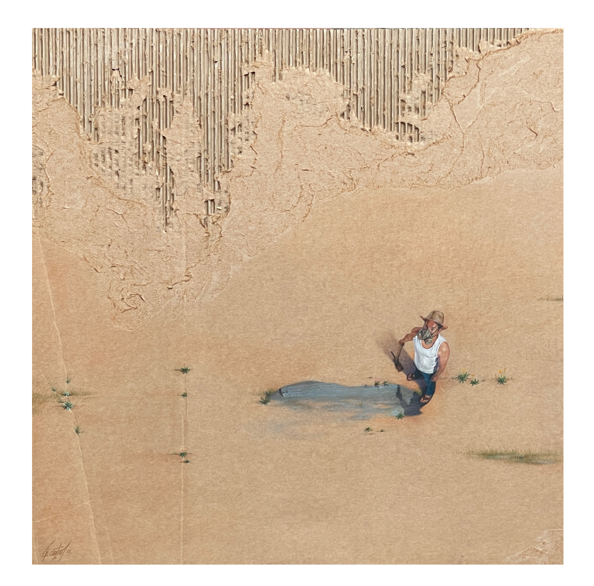
Armando Castro-Uribe, Bitter Sigh, 2022, mixed media on cardboard, 66 x 72 cm