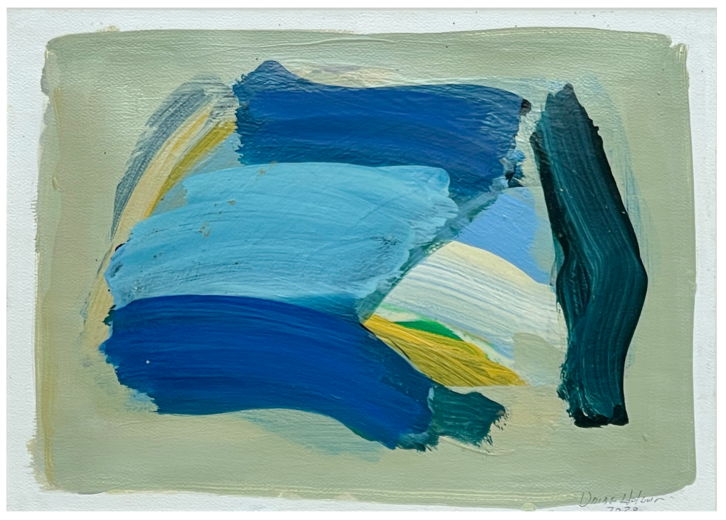
Santiago Uribe-Holguin, Shapes and Shades B, 2020, 35 x 50 cm.