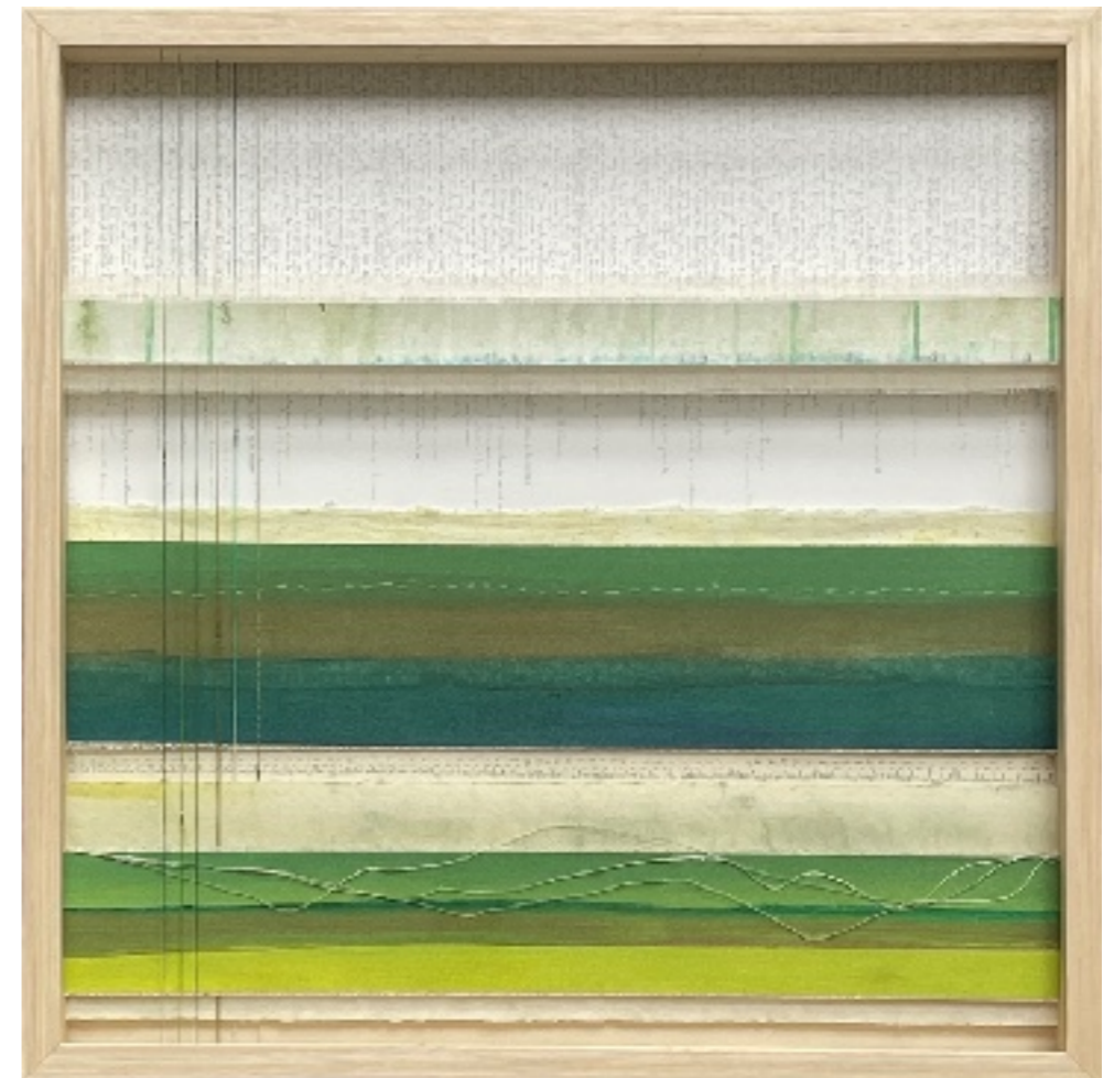
Angelica Chavarro, Landscapes of Thought B, 2024, assemblage of intervened natural fiber fabrics and mixed media, 71 x 71 x 7.4 cm.