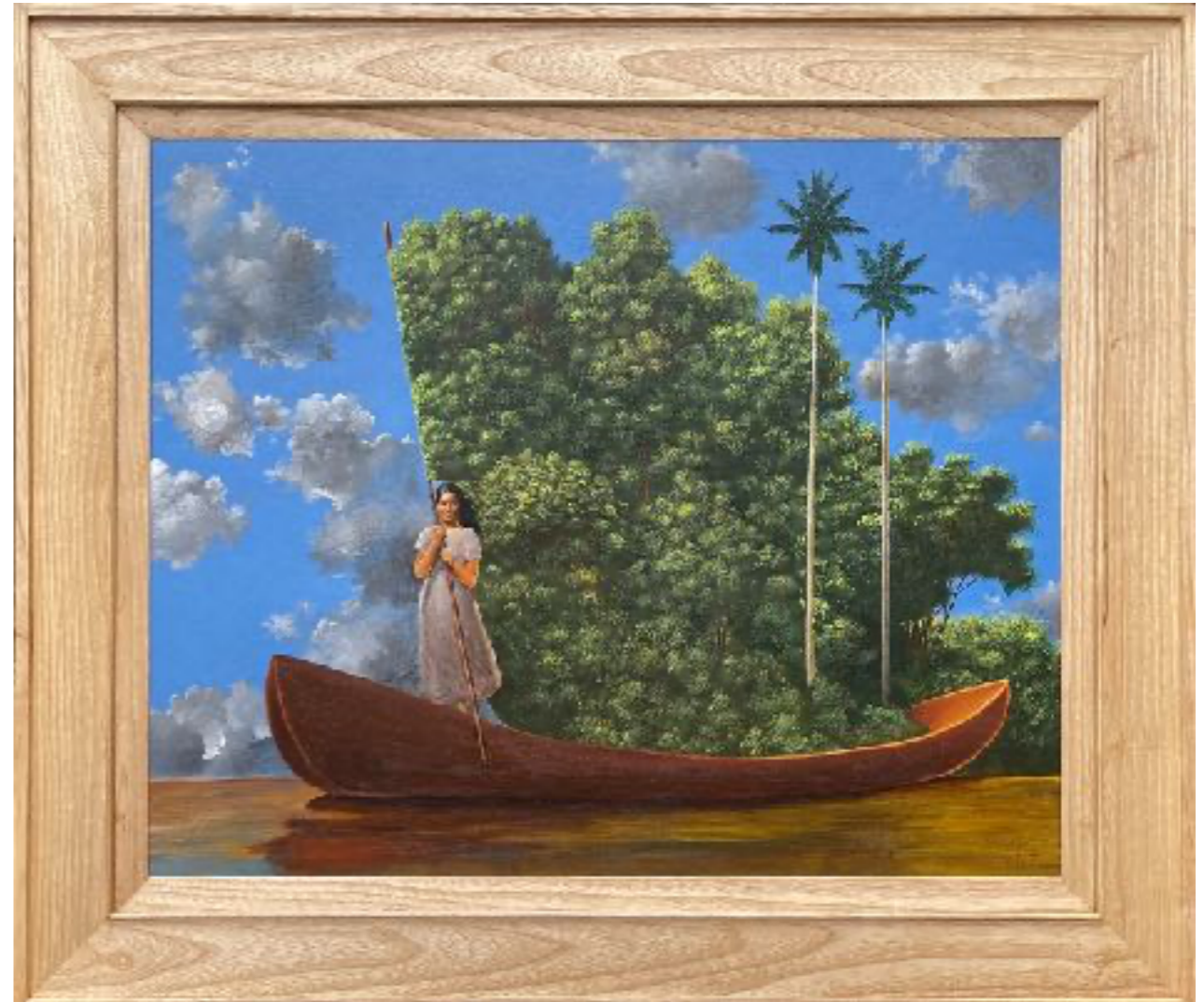
Pedro Ruiz, Displacement 296, 2023, acrylic on canvas, 72x 89,5 cm.