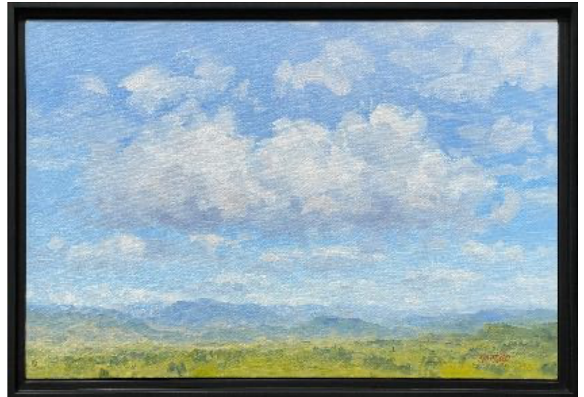
Carlos Nariño, Investigación para un lugar, 2024, Oil on canvas, 27 x 41 x 4.5 cm.