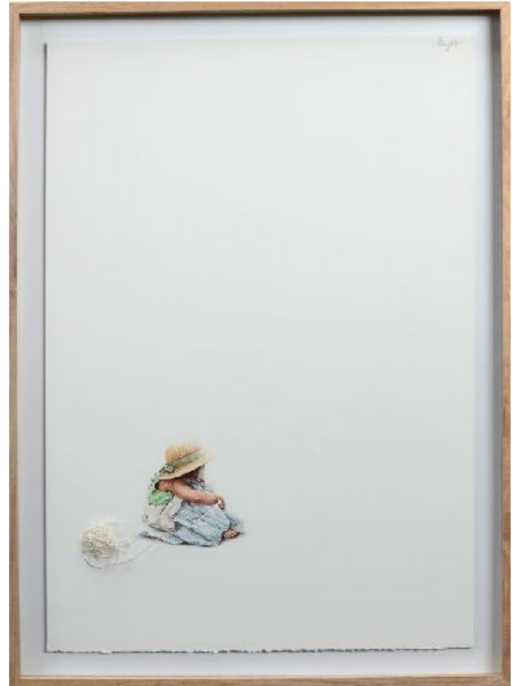
Pablo Arrázola, Apuchumala No 44, 2024, colored pencil drawing on cut and wrinkled cotton paper, 100 x 70 cm.