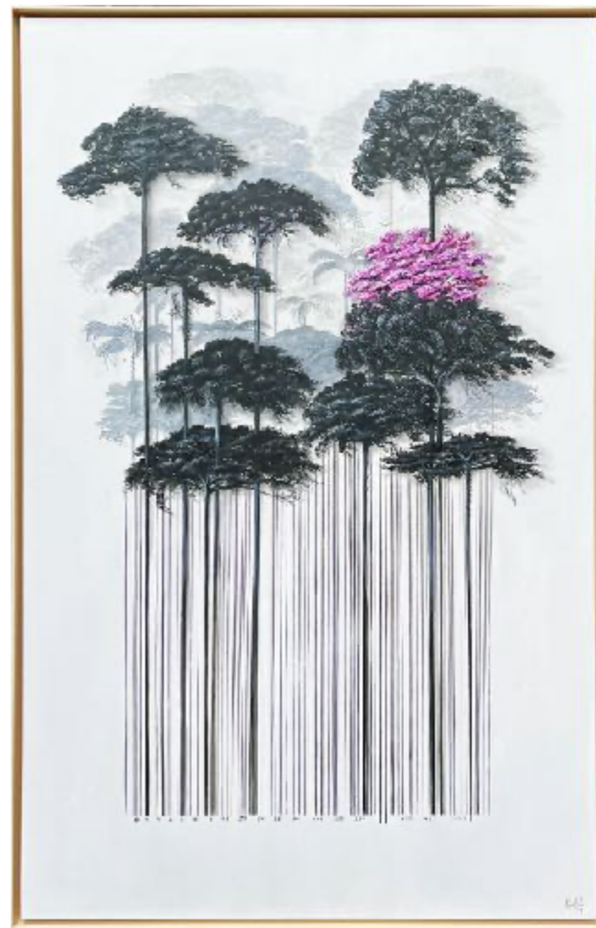
Camila Echavarría, Happiness is When You Close Your Eyes and Feel the Wind, 2024, acrylic on canvas, 161 x 100 cm.