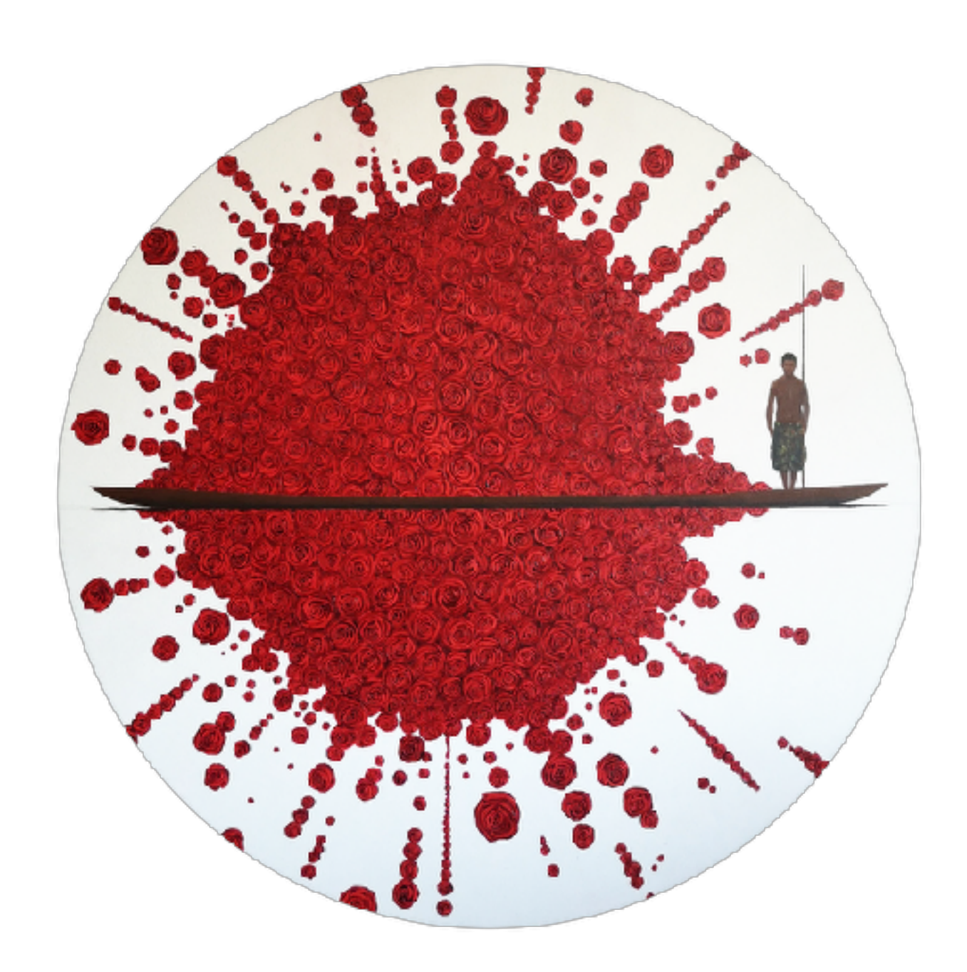
Pedro Ruiz, Displacement No.285, 2023, acrylic on canvas, ø 130 cm,