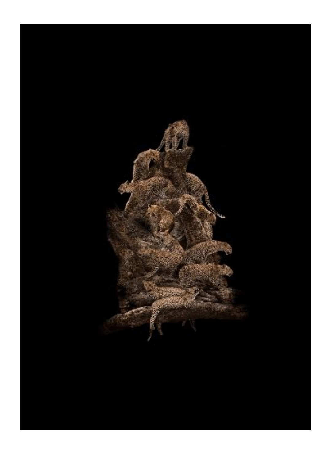
Mario Arroyave, Leopard Tree, 2016, glicleé print on metallic paper, 110 x 90 cm