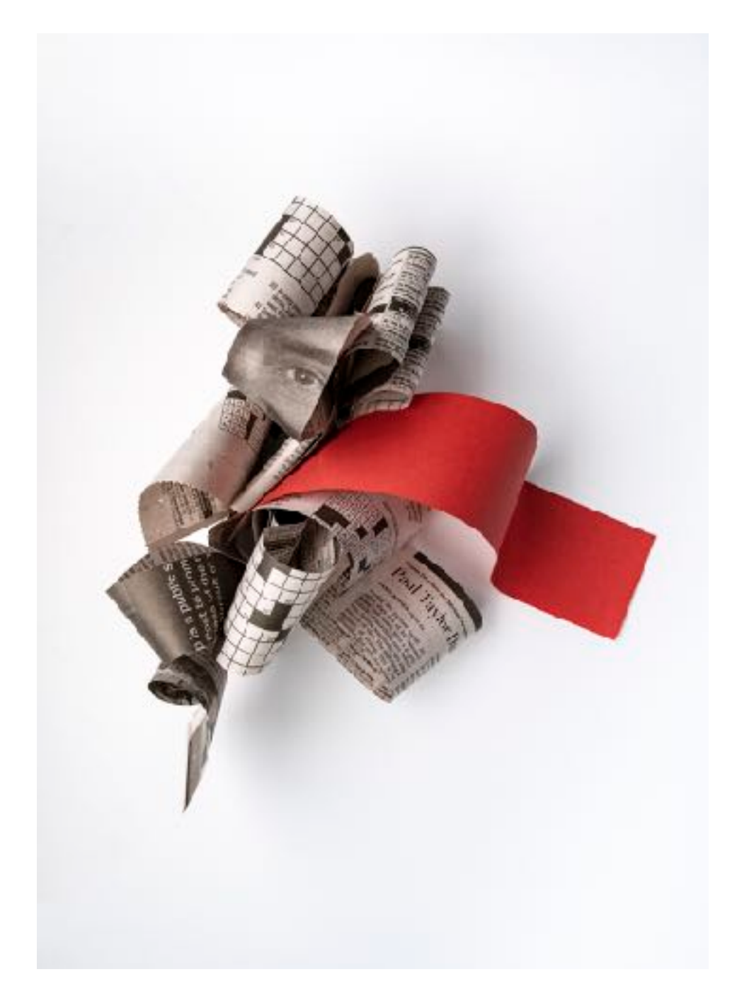
Jairo Llano, Who's the Dancer?, 2022, digital print, 70 x 100 cm.