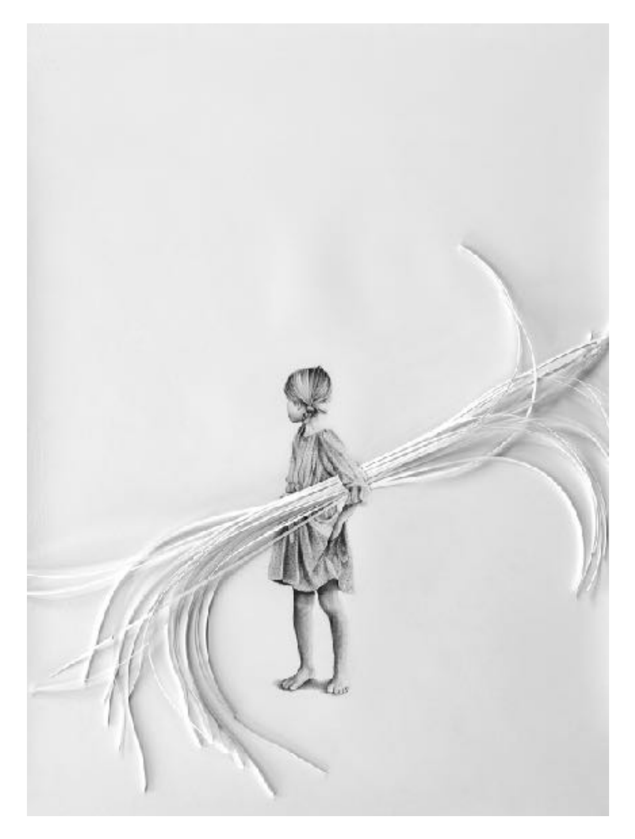
Pablo Arrázola, Kiko - Composition 2, 2023, graphite on folded and cut cotton paper, 100 x 70 cm.