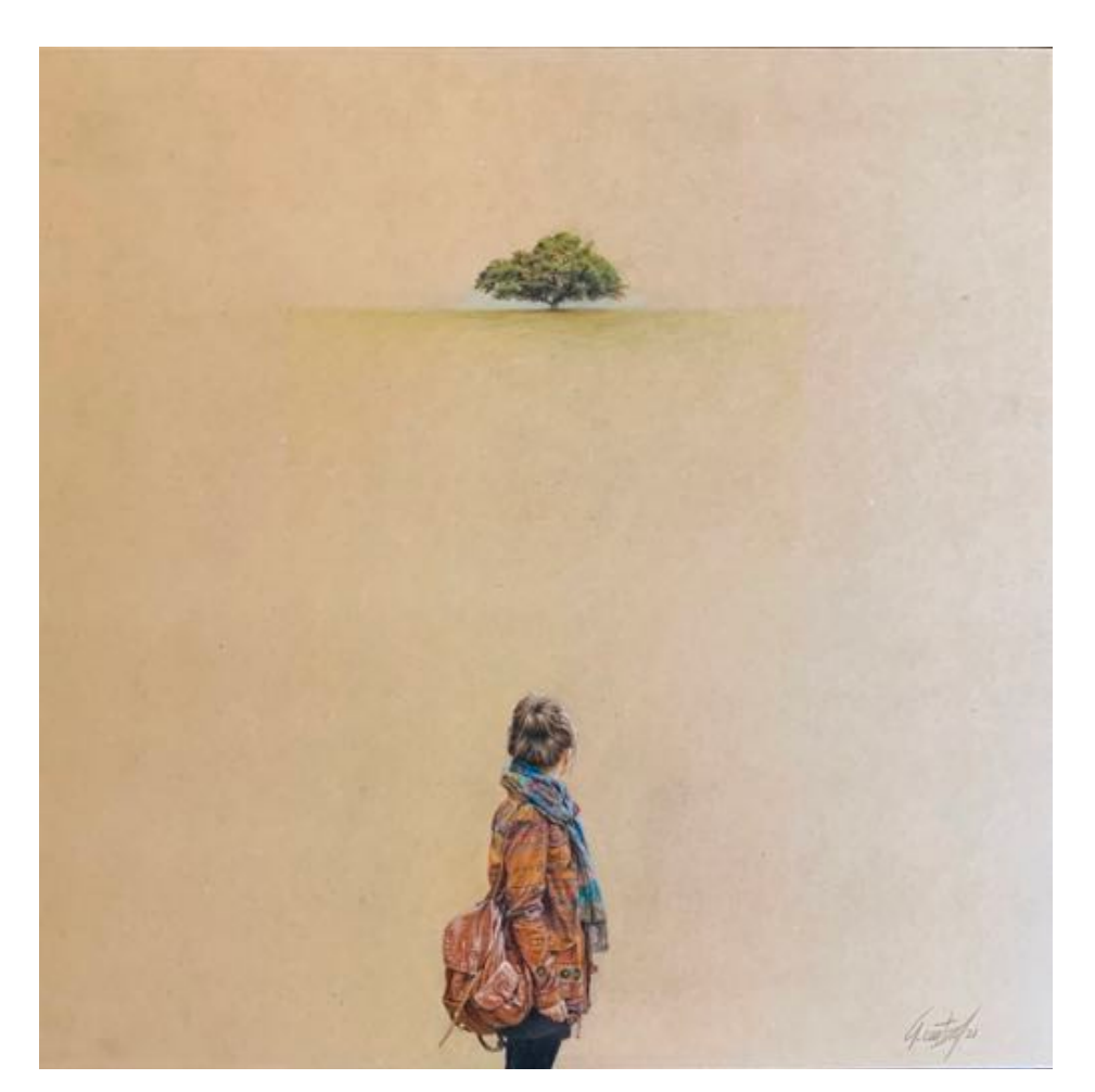
Armando Castro, Greta, 2021, mixed media on mdf, 40 x 40 cm