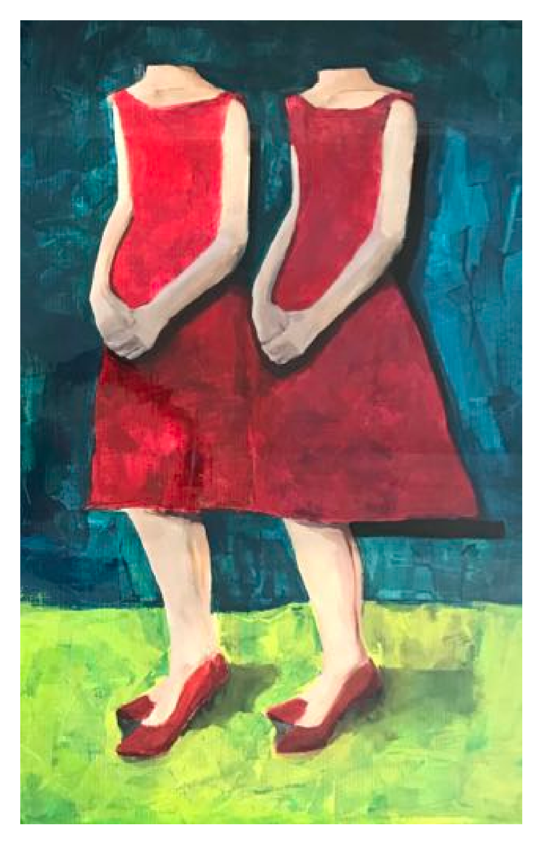
Carolina Convers, Mutable Vermillion, 2020 Acrylic and resin on cardboard, 124 x 84 x 3 cm